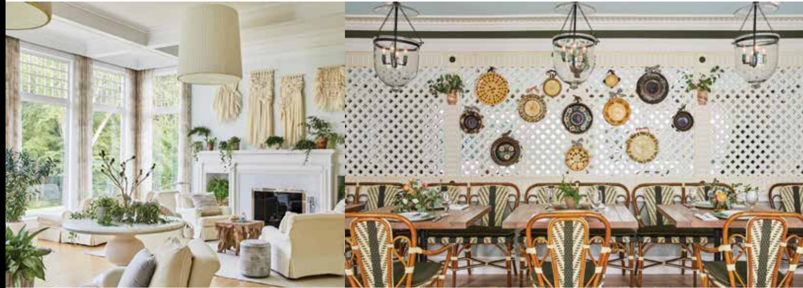
The newly refurbished Mayflower Inn & Spa is a perfect hopping off point to enjoy the wonders of the Connecticut countryside

Be sure to visit White Memorial Conservation Center in Litchfield and explore the four-thousand-acre nature center and wildlife sanctuary where you can hike, horseback ride, camp and birdwatch. A trip to nearby Hidden Valley Preserve unveils seven hundred acres of meadows and forests and seventeen miles of trails while a visit to the Institute for American Indian Studies gives families an opportunity to time travel back ten thousand years and discover Native American history.