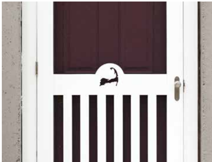
Cape Cod map cutout in Eastham

For those of you who think Seaport Shutter Company is a Cape Cod showroom in Brewster that creates only custom exterior and interior shutters, we have some news. Along with custom shutters, Seaport Shutter Company manufactures a wide range of custom products including mahogany screen and storm doors, Adirondack chairs and mahogany signs. While it is true that Seaport Shutter has a showroom in Brewster, it also has a sales office in Natick and a production facility in Chatham. The team travels well beyond the Cape, ships products across the country and excels at the art of customization.